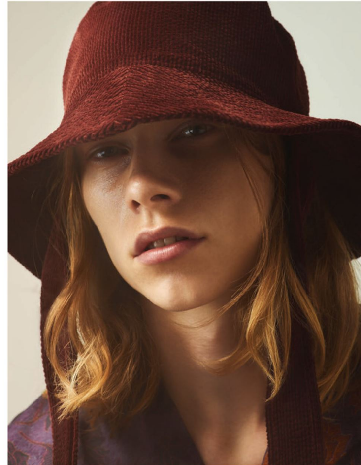
shirt and hat by DAMIR DOMA