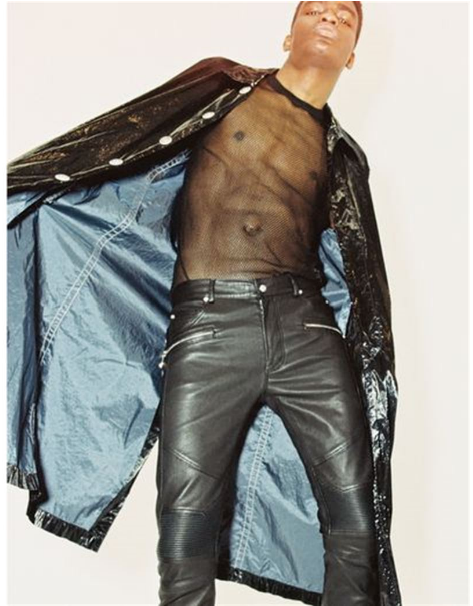
This page: Top Balenciaga, shorts Balenciaga, longcoat Andy Warhol, necklace and boots Balenciaga Opposite page: Oscar De la Renta, shirt De la Renta, trousers Balenciaga