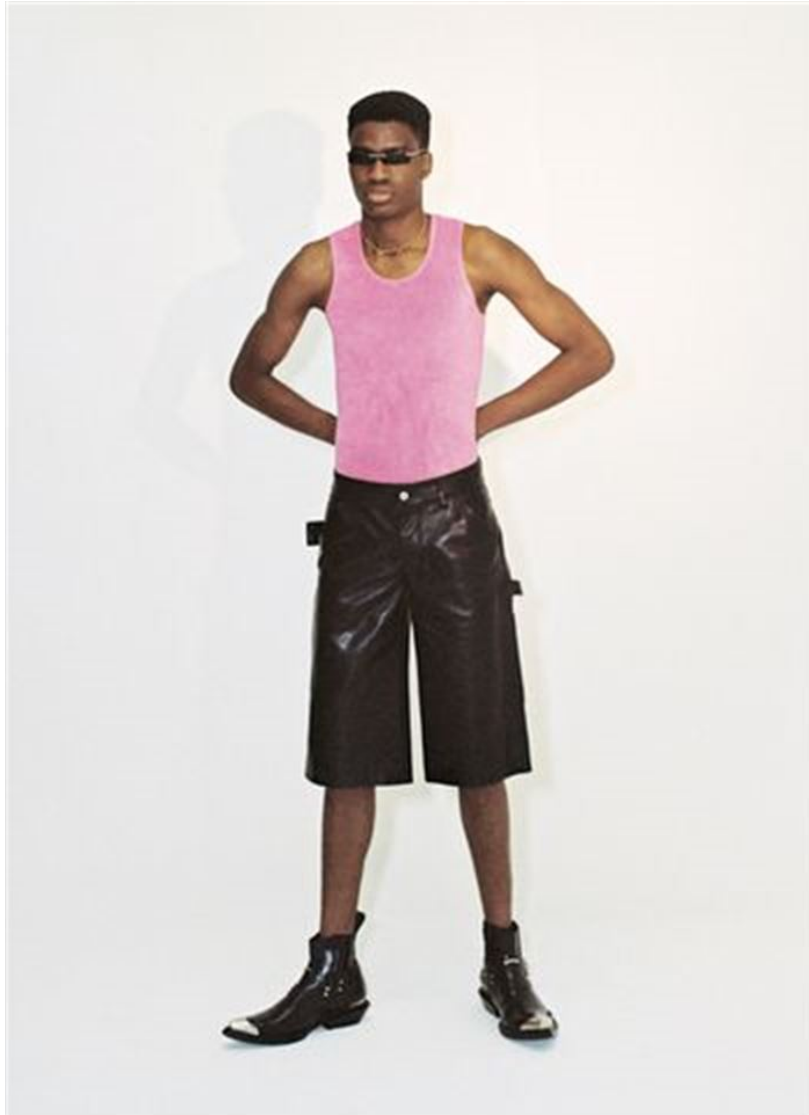
Previous left: All clothing Alexander McQueen