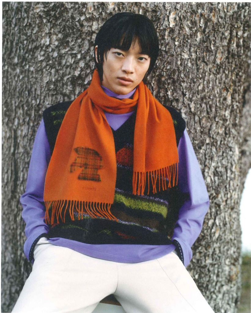
Akito indossa una sciarpa 25x150 cm in cachemire ricamato con lana.