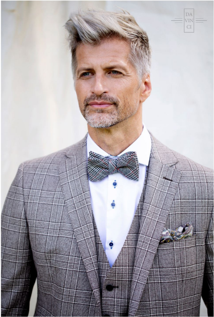
SUIT FROM ALDO RIZZO LIEGE